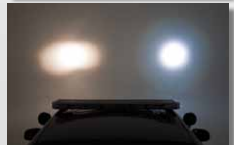
Comparison showing typical 50 watt halogen lamp on left and PAR-46 ultra bright Super-LED on right.